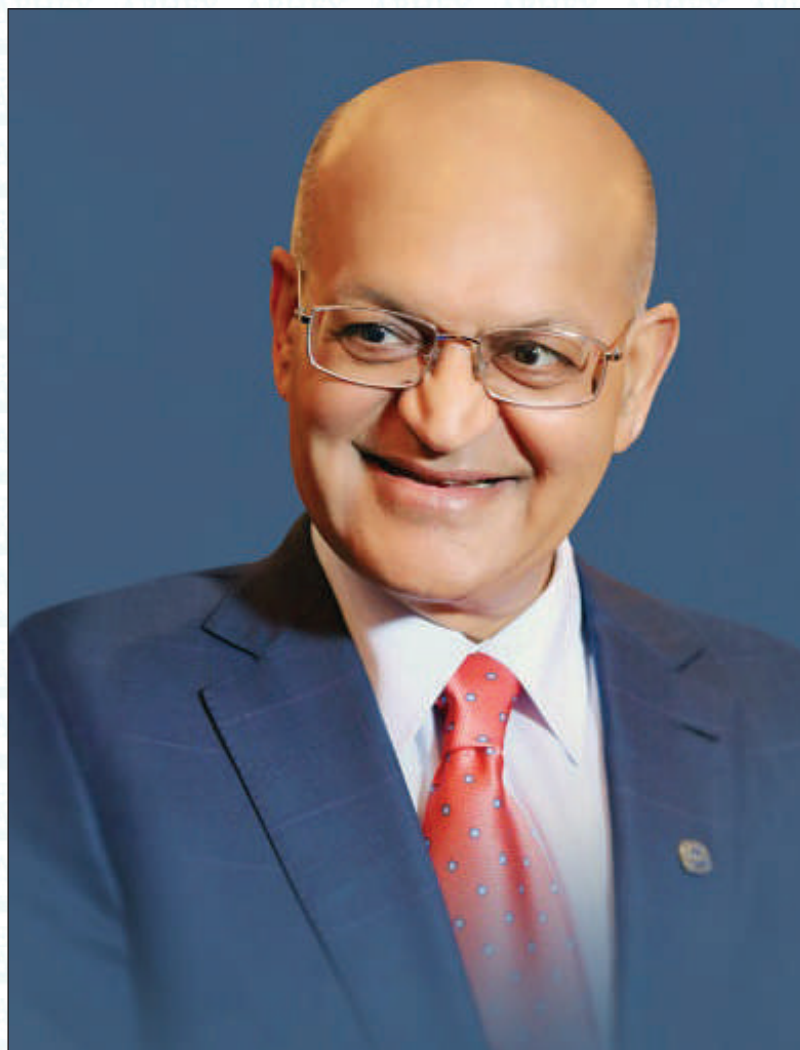
Hon'ble Shri Abhey Kumar Oswal